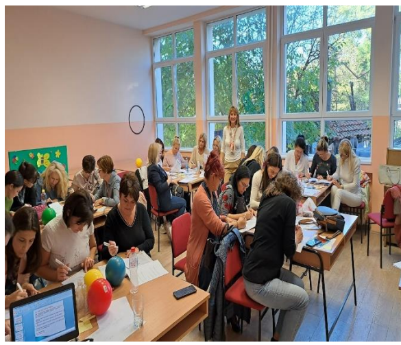
The joy of movement, 15. 10. 2022.