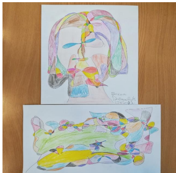
Games with visual elements, 29. 10. 2022.