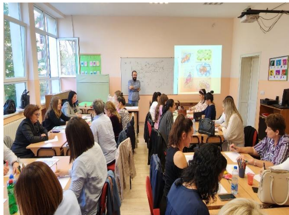
Games with visual elements, 29. 10. 2022.