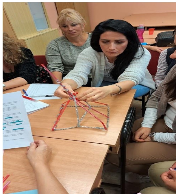
The influence of toxic stress on the early development of brain architecture, 22. 10. 2022.